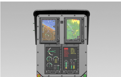
Glass Cockpit with Howell Instruments Engine Instruments Display & Garmin G500TXi MFD/PFD