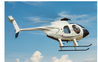
Bushveld Game Capture: Wildlife Management