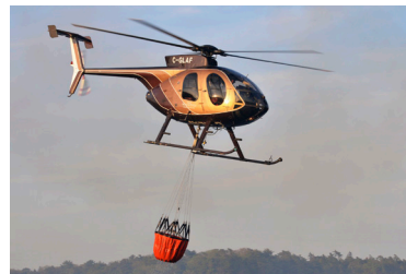
Canadian Dept. of Natural Resources: Fire Control