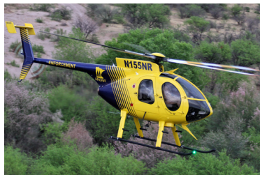
Minnesota Department of Natural Resources: Enforcement Division