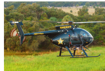
Polk County Police Department: Search & Rescue